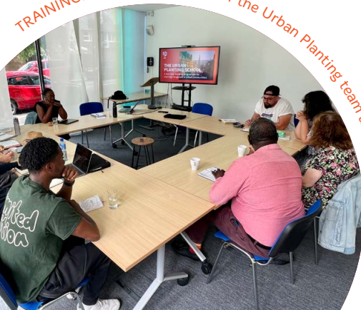
TRAINING: The first gathering of the Urban Planting team ahead of its 2024 launch