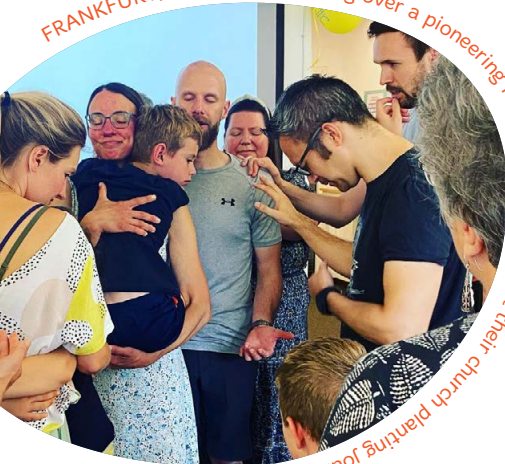
FRANKFURT, GERMANY: Praying over a pioneering family before they start their church planting journey in Flensburg