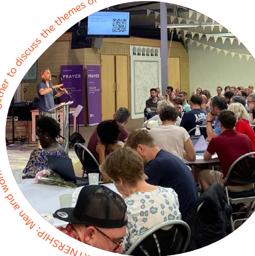
FRUITFUL PARTNERSHIP: Men and women coming together to discuss the themes of Gender Quality