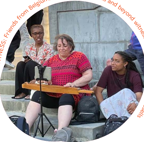
EVERYONE A WITNESS: Friends from Belgium, France, Netherlands and beyond witnessing on the streets of Brussels