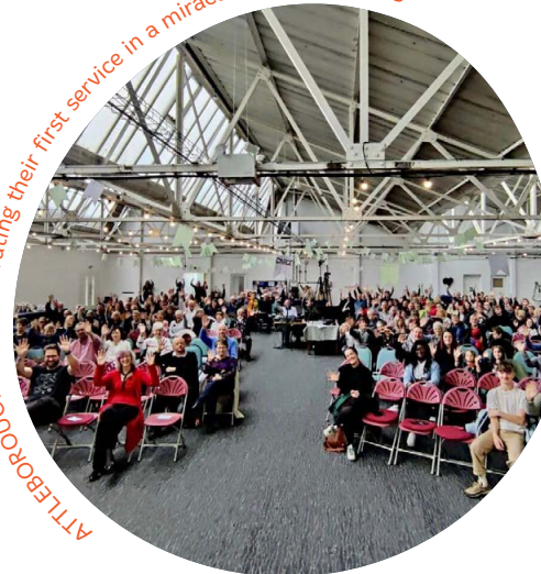
ATLEBOROUGH, UK: Celebrating their first service in a miraculous new building