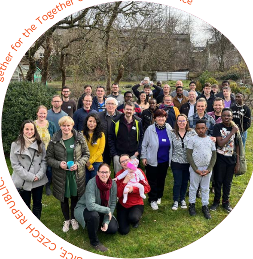
PARDUBICE, CZECH REPUBLIC: Churches joining together for the Together on a Mission conference