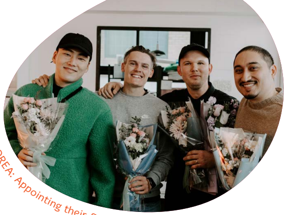
SEOUL, S. KOREA: Appointing their first eldership team