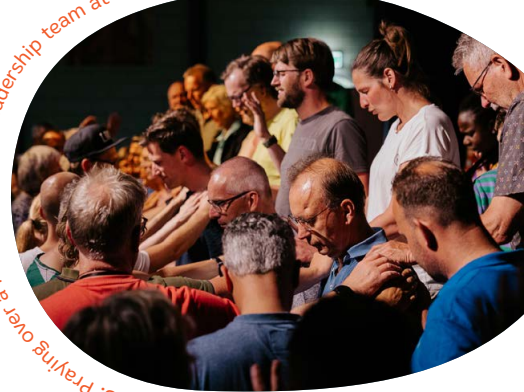
NETHERLANDS: Praying over a new nationwide leadership team at the RM NL family camp